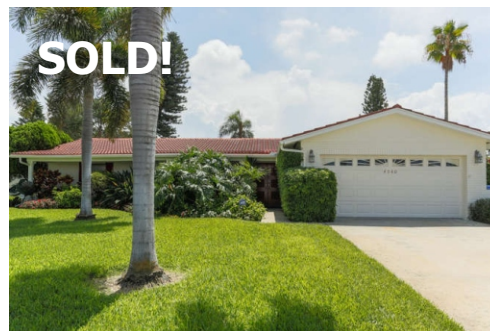
4560 38th Way S - Listed at $500,000 3 Bedrooms / 2 Baths - 1,772 sq ft Enclosed Florida room and covered lanai

Check out a short video about ASPEC at https://vimeo.com/55391939