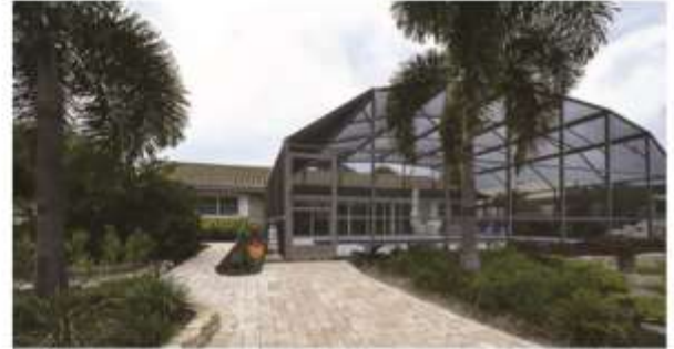
4490 40th Street South Active with Contract