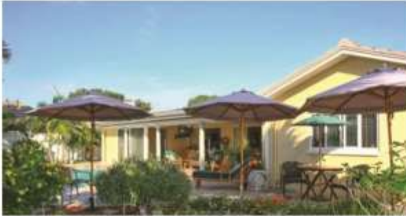
4429 39th Street South Recently Listed and Sold

Inventory is LOW and we have Buyers! Please contact us for all of your Real Estate needs. We are here to help you Buy, Sell or Relocate!