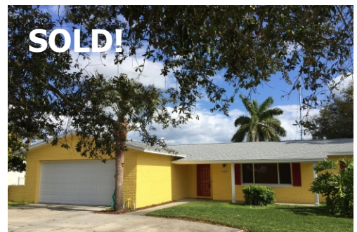
4460 38th Street S - Listed at $479,000 3 Bedrooms / 2 Baths - 2,136 sq ft Awesome kitchen. Mooring for up to 70' sailboats.